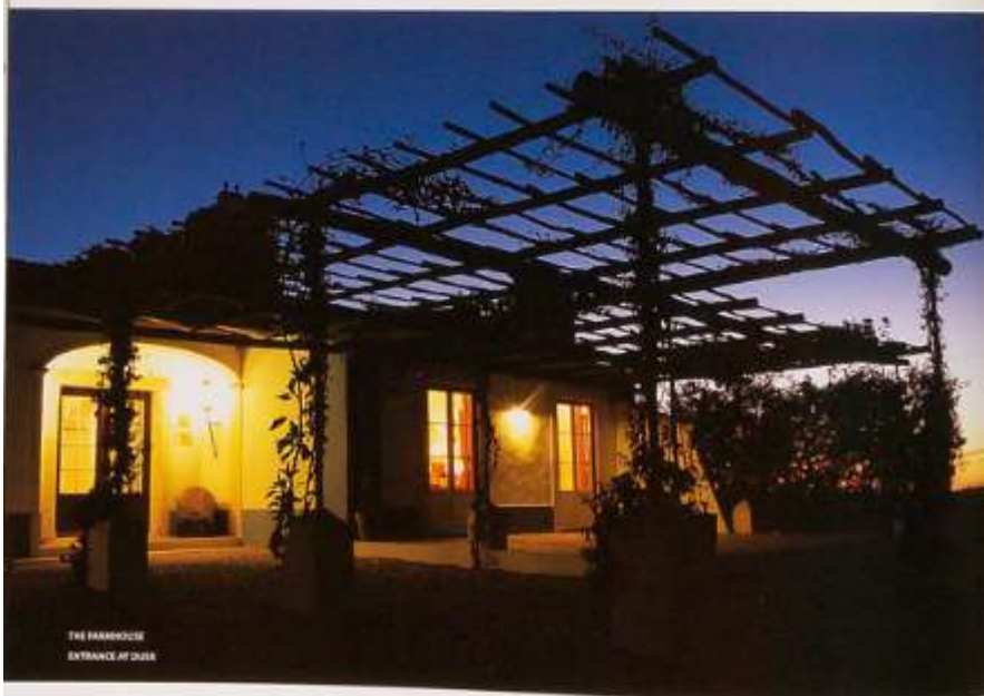
THE PARADISE ENTRANCE AT DUSK